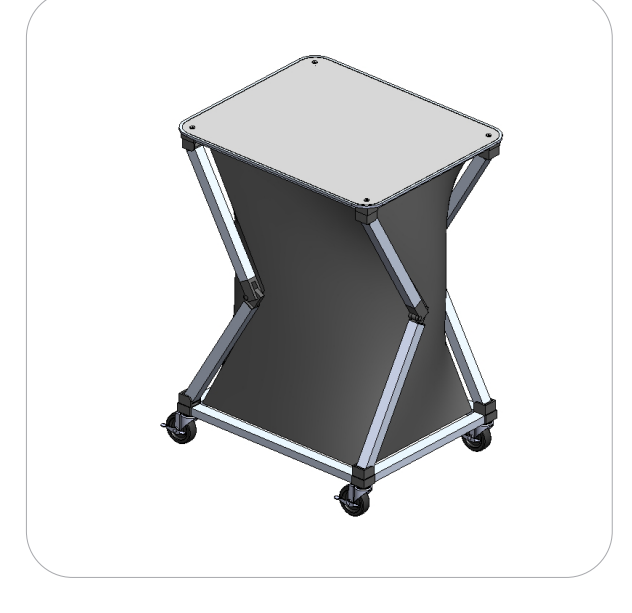
Step 2. Unzip and insert shelves.