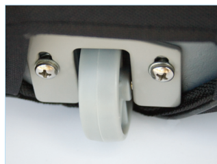
Bag includes wheels