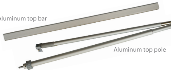
Aluminum top pole